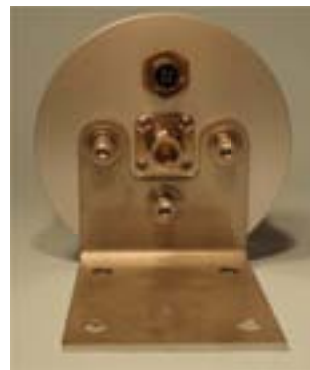
CPO235-4.5-R/QHO230-R combination antenna, with single RF connector and DC control connector. The antenna has an internal PIN diode RF switch.