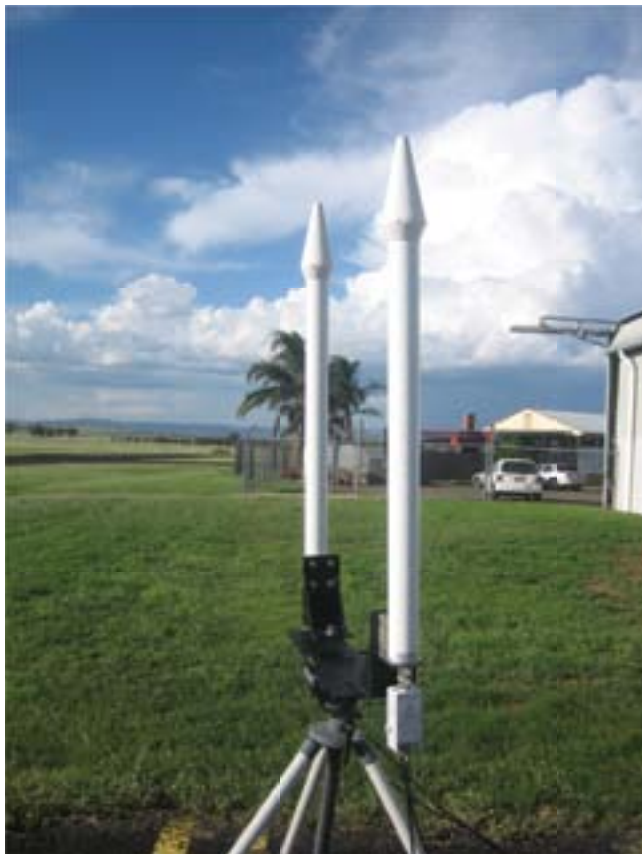
CO250-11/QHO260-R combination antennas each with dual RF connectors. This 4-way diversity system receives a transmission from a helicopter that can be far out at the horizon or close in and overhead. The helicopter was equipped with a vertically polarized PA16 steerable array antenna with an integrated RHCP downlook antenna selectable by RF switch.

Please contact us if you have a requirement that would benefit from such a combination antenna.