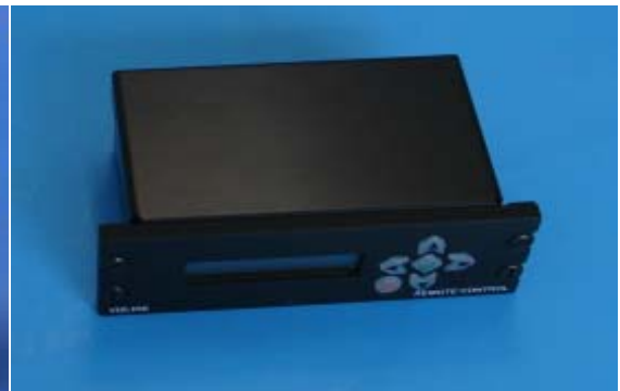
2 line rack-mount LCD display