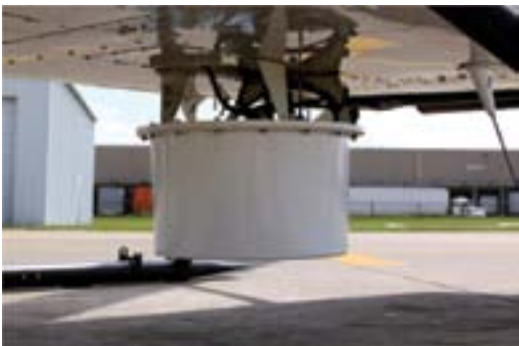
Installation under Robinson R44

From left to right: Beam overlap, showing enhanced hand-off with squint-in feature; azimuth beam, measurements and simulation; elevation radiation pattern