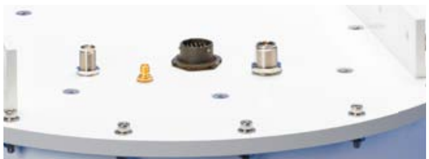
Top plate connectors