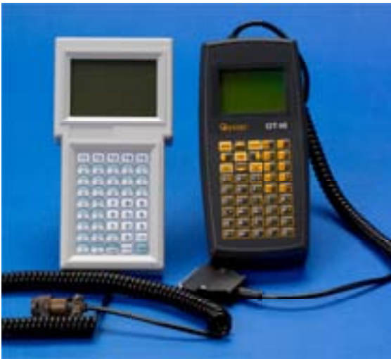
Pro-Term (left) and Oyster (right) hand-held terminals